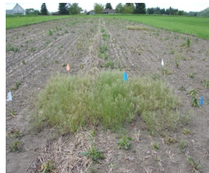
Chemical fallow plot