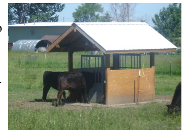
Bair steers at the mineral feeder.