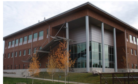
The new Animal Bioscience Building

With special thanks to the entire A&RS Administrative Team