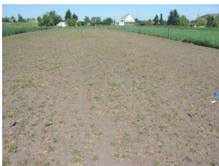
Grazed fallow plot

Melissa Graves, who is going to be a presenter at the upcoming SRM, is a current MSU graduate student working with Dr. Pat Hatfield. Melissa has had some very interesting preliminary data that has indicated grazed fallow plots showed 95% less weed biomass when compared to chemical fallow plots, indicating that sheep grazing as a weed control option can be more effective than chemical control (see pictures below).