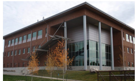
The new Animal Bioscience Building

With special thanks to the entire A&RS Administrative Team