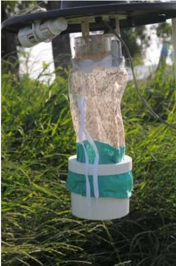
Mosquitoes, captured in CO 2 -baited trap, used for testing Cache Valley virus.