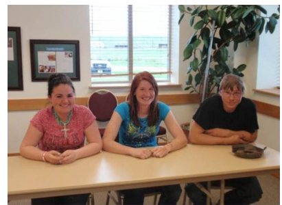
Animal & Range faculty and staff open forum at Ft. Keogh in Miles City, MT.