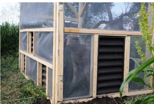
Lamb enclosed in vented mosquito trap.

We are also evaluating on-animal treatments of pyrethroid insecticides to determine if an insecticide will protect sheep from mosquito feeding and subsequent disease transmission. Treatments include the PYthon ear tag (20% zeta-cypermethrin + 20% piperonyl butoxide) at one tag per animal, a pyrethroid pour-on (2.5% permethrin + 2.5% piperonyl butoxide) and an untreated control. One