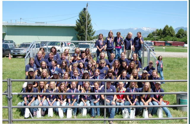
2011 Youth Horsemanship School participants.