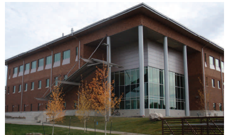
Animal Bioscience Building