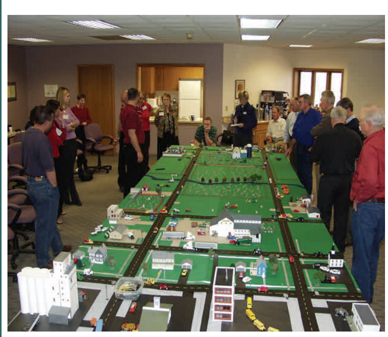
Table-top interactive scale model of a rural American community used for this training.

This educational program of the Montana Agro-Emergency Preparedness Committee and MSU Extension will be held on Wednesday, November 9, 2011 at Montana State University in Bozeman. The program is offered at no charge to participants. It was funded by a U.S. Department of Homeland Security grant, administered by Montana Disaster and Emergency Services.