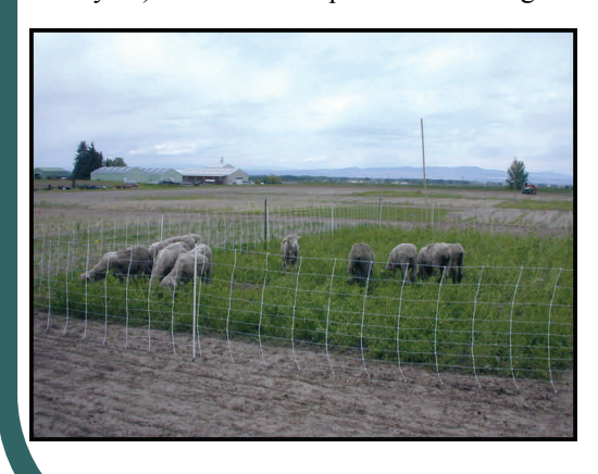
Before and after photographs of sheep used to terminate a cover crop used in an organic crop rotation system at Post Farm (off Huffine Road in Bozeman).

In conjunction with the Sustainable Food and Bioenergy Systems: Interdisciplinary B.S. Degree Program and the new sustainable livestock production option, Patrick Hatfield is developing and teaching a new class: ARNR 222 Livestock in Sustainable Production Systems. This course will consider all aspects of incorporating livestock (sheep, goats, beef and dairy cattle, poultry, and swine) into sustainable production systems. In addition to Hatfield, this class will draw on the expertise of Glenn Duff (beef and dairy), and Charles Holts (Poultry). The course is divided into a series of modules. The course goals are: a) Students develop a better understanding of the concept of sustainability as it applies to livestock and livestock integrated into other agricultural systems. b) Expand student appreciation for beneficial traditional and non-traditional partnerships that promote sustainability. c) Further develop critical thinking and evaluation skills.