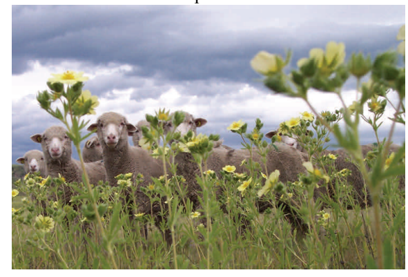
Sheep graze in a patch of sulfur cinquefoil in Lake County, MT. The project explored the potential for sheep grazing or mowing to reduce the seed production of this noxious, invasive plant.

in some areas. Sheep are also recognized as an effective tool to control this plant and fine-tuning the grazing prescription has been a focus of Mosley and Roeder's research in recent years. While sheep and biological control agents have undoubtedly been working together on rangelands, there has been no attempt to quantify if the sheep have a negative impact on the bug populations by consuming the seedheads where most bugs lay their eggs or even consuming the bugs themselves. While the bug populations decline immediately following grazing, the decline is short lived and bug populations have been able to sustain despite grazing disturbance for 3 years. More importantly, the combination of sheep and biological control insects has reduced the viable seed added to the seedbank by 99%. The effects of this are being manifested already on the study site as grazed plots produced many fewer seedlings last spring. Although at first glance they seem to be an odd couple, him at less than linch long and weighing only grams, while she is 40 inches tall and over 100 lbs, they appear to be a perfect pair for controlling spotted knapweed!